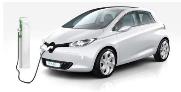
Figure 3: Electric vehicle, www.eta.co.uk