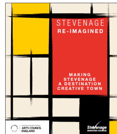
Figure 8: Stevenage cultural strategy