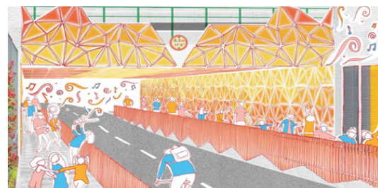
Figure 9: Holmes Street Tunnel, Shakopee (right). Wandsworth underpass improvement project (left)