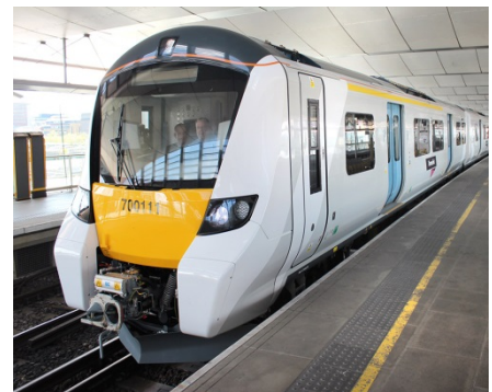
Figure 4: Thameslink train