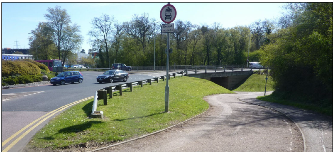
Figure 1: Stevenage transport network