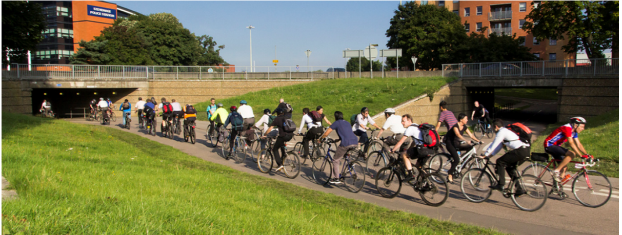
Figure 2: Stevenage cycle network