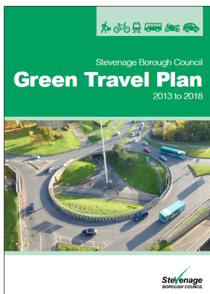
Figure 5: SBC Green Travel Plan

majority of staff working at the Council do not live far from the office, there is considerable scope for an increase in the proportion of journeys that are made on foot or by bike.