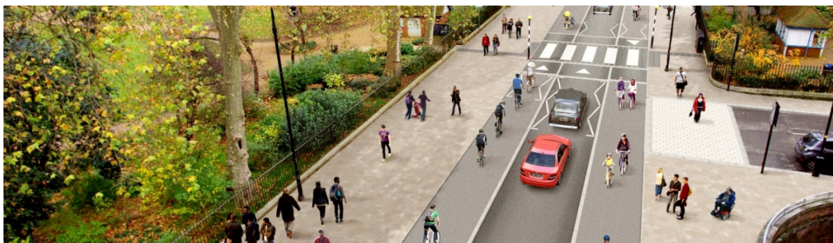
Figure 6: Oxford Liveable Streets

6.7 The Council will work with experts such as Living Streets and Sustrans, who have proven experience of what can be achieved.