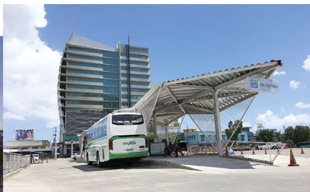
Figure 7: Bus station design ideas